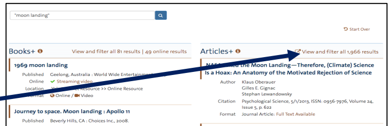
Image 1: The results screen in Quicksearch, with Books+ and Articles+ options.